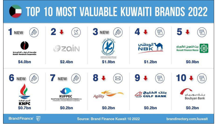
The top order: Kuwait's top 10 brands

KPC's brand architecture is hybrid in nature while its peers in the region and internationally have moved to a branded house approach to build a strong global brand to appeal to their unique set of stakeholders as key enablers of the global transition to renewable energy in the medium to long term while delivering optimal value to their shareholders.