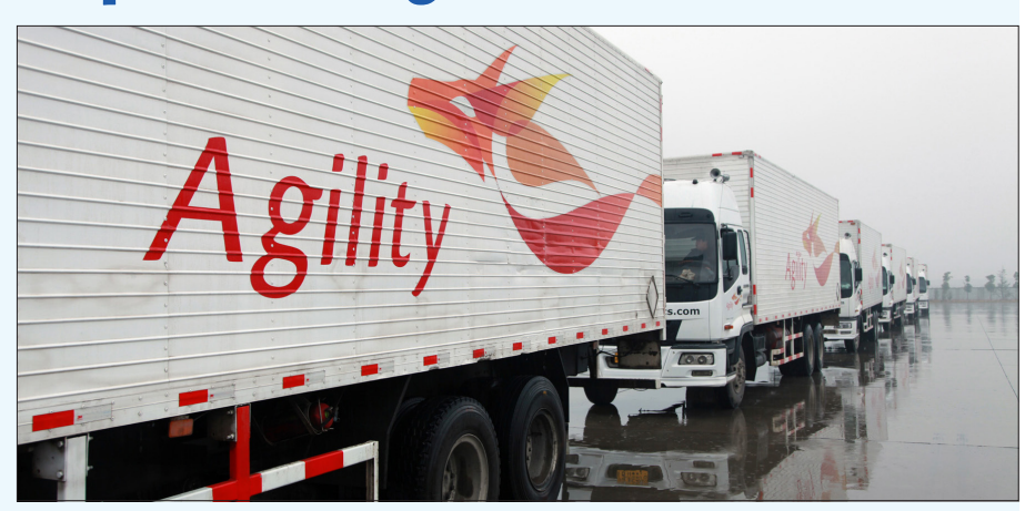
Agility: robust performance

Controlled: Agility continues to own and operate the businesses that have historically generated 80 per cent of