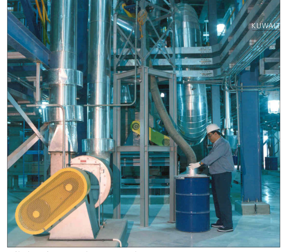
A file photo of Kuwait Catalyst Company's plant in Kuwait

Kuwait seeks to develop the investment climate, attract foreign direct investment (FDI) as an important source of financing development activities and to increase the role of the private sector in supporting economic growth. In this context, the total FDI balance increased during the past years to $45.7 billion by the end of 2020, compared to $42.8 billion in the previous year, with an increase of 7 per cent.