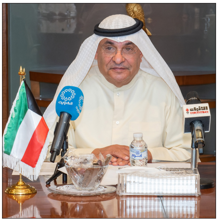
KCCI chairman Muhammad Al-Sager

World Bank in its report predicted that Kuwait's economy is set to grow by 5.3 per cent in 2022, followed by a 3 per cent growth the next year. According to Kuwait's Central Statistical Bureau, Kuwait's nominal GDP for 2020 was $118.8 billion. In 2021, the Central Bank of Kuwait announced that Kuwait's GDP had contracted 9.9 per cent in 2020 from 2019 mainly due to sharp decrease in oil prices.